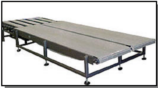
Twin belt incline feed to