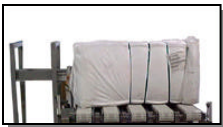
500 lb bale ready to transfer